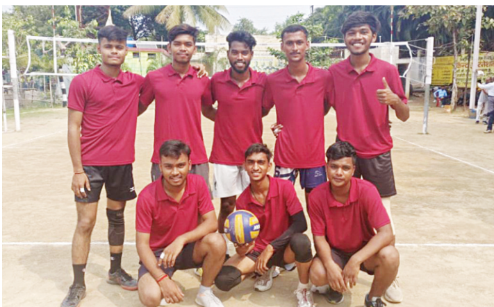
COLLEGE VOLLEY BALL TEAM