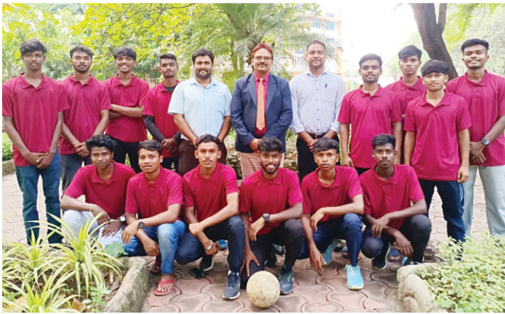
COLLEGE FOOTBALL TEAM